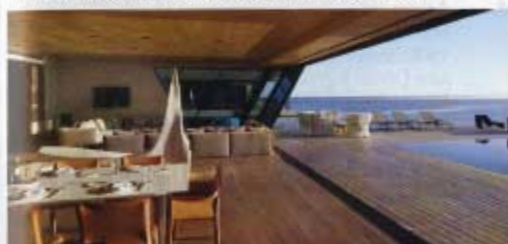
From top: Playa Vik; Hotel Las Piedras Fasano; La Huella.