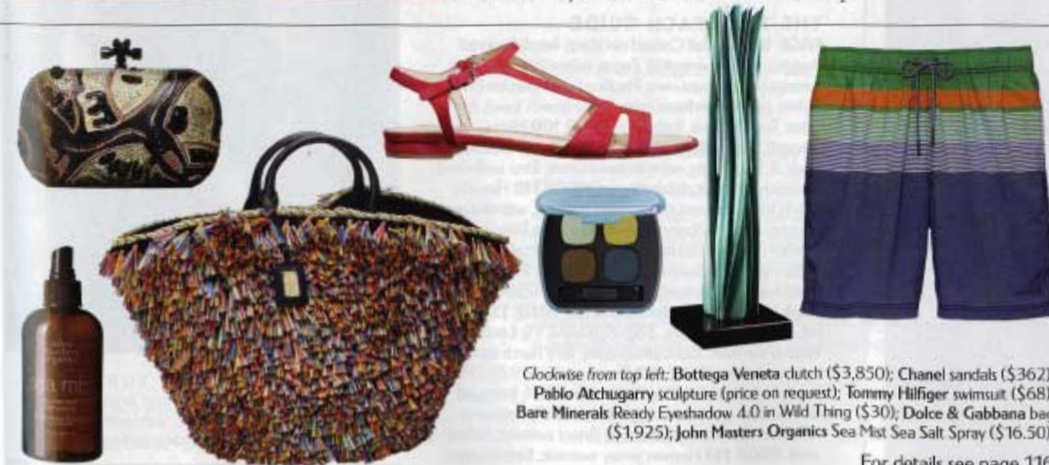
Clockwise from top left: Bottega Veneta clutch ($3,850); Chanel sandals ($362); Pablo Atchugarry sculpture (price on request); Tommy Hilfiger swimsuit ($68); Bare Minerals Ready Eyeshadow 4.0 in Wild Thing ($30); Dolce & Gabbana bag ($1,925); John Masters Organics Sea Mist Sea Salt Spray ($16.50).

"I've been going to José Ignacio since I was a little boy. I like that it's still, for now at least, not very developed. You rent a house in town and you don't even get in your car. You go on a bicycle or you just walk everywhere. I go to the beach, of course, every day with my family. I like to have lunch at La Huella, which is one of my favorite restaurants in the world. They have very good grilled fish and calamari, and an amazing dulce de leche lava cake. There's a surf shop in town that is really nice, and there's a great place to buy things for the house called Sentido. A lot of times I combine going there with my family on vacation with a little bit of polo at the Punta del Este Polo Club."