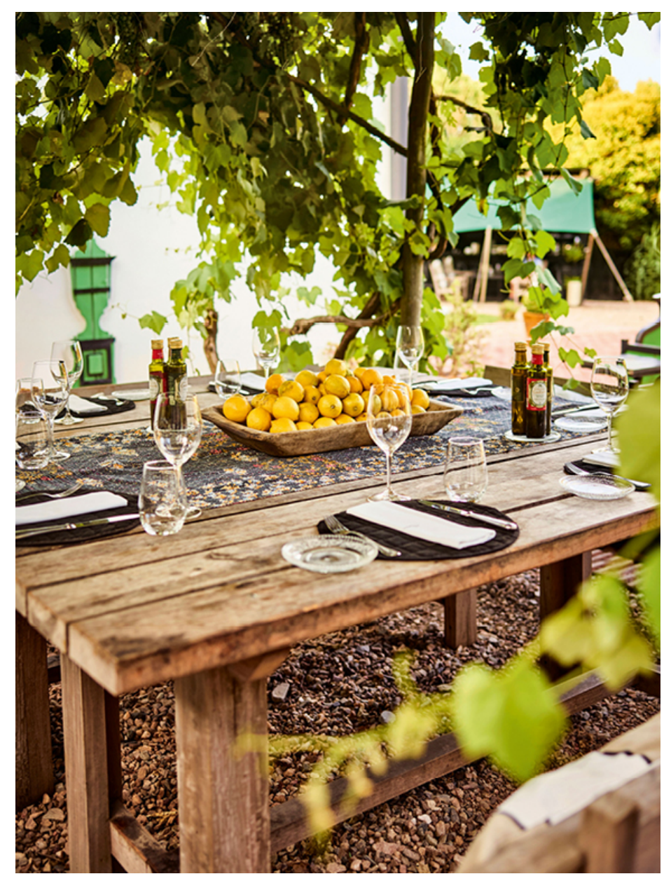
Dining under the vines at Restaurante Garzón.

It was early December 2019, and I was back in Uruguay for the first time in over a decade. I'd justified my carnivorous meal by framing it as a litmus test. Had the menus changed at this cluster of parillas (restaurants specialising in steak, sausage, and organ meats, grilled over firewood and charcoal) in a former produce market in Montevideo? Had the stalwart, working-class feel of the place become prissy and boutique? Of all my childhood memories of Uruguay, the parilla was a cornerstone.