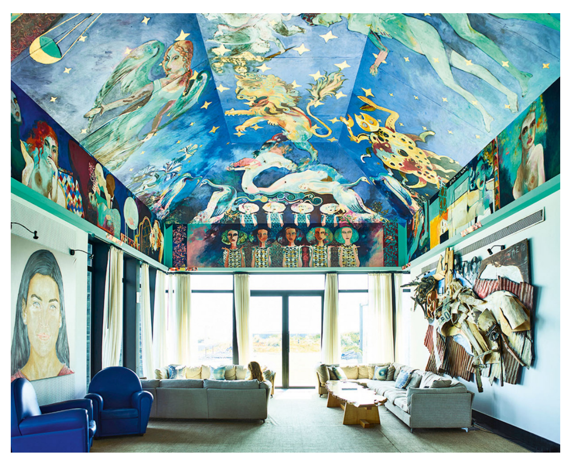
The mural-clad Zodiaco lounge and restaurant, at Bahia Vik.

I ordered a sirloin milanesa , the classic breaded dish typically made with veal or beef. Coated with a mix of panko, bread crumbs, brioche, and Parmesan, it was three or four times thicker than any I've tried, yet extraordinarily tender. The grilled octopus, accompanied by cubed potatoes so smooth and unearthly they looked computer-generated, was briny, smoky perfection (everything at Restaurante Garzón is cooked with wood fire). The raw-zucchini salad with mint and wide-shaved Parmesan was category-shattering.