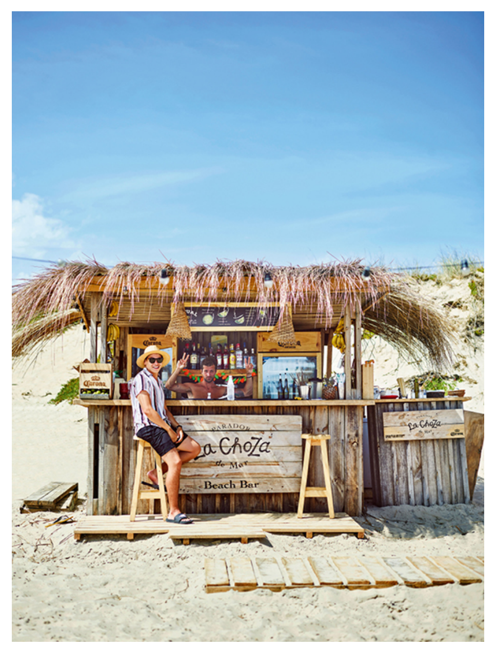
One of the shacks lining the beach at José Ignacio, where the vibe is exclusive but always low-key.

always regarded as a no-frills bolt-hole for affluent Argentines, had recast itself as a glitzy, global destination that people were now describing as the 'Uruguayan Riviera' and the 'St Tropez of South America'.