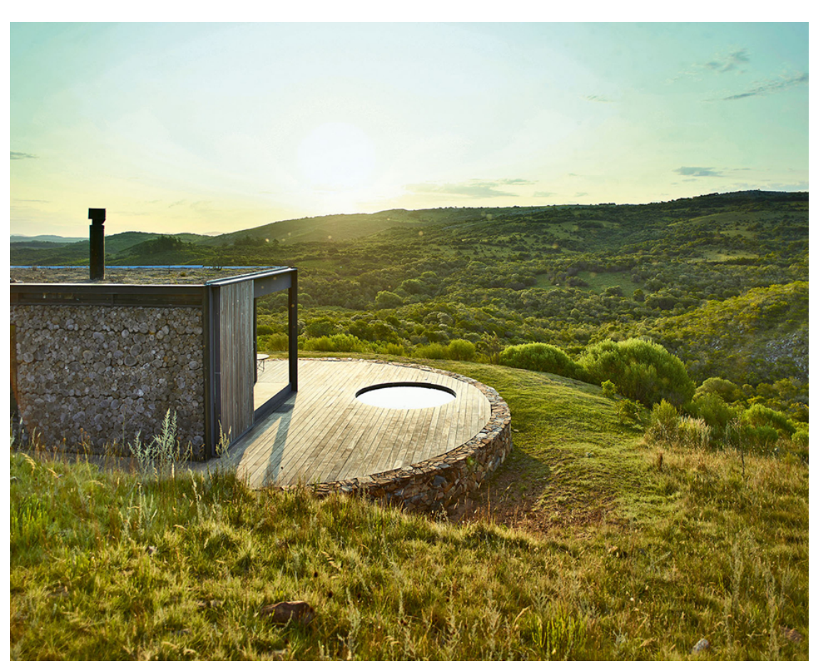
A guest villa at Sacromonte Landscape Hotel.