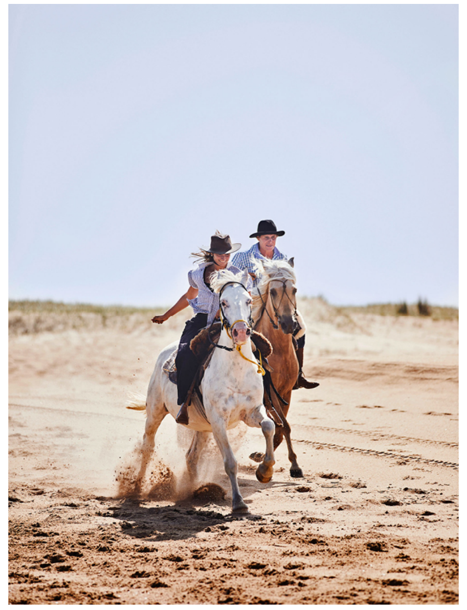
Horseback riding on Laguna Garzón, near the beach town of José Ignacio, Uruguay.

My grandparents fled Serbia during World War II and settled in Montevideo, Uruguay's capital, in the beachside neighbourhood of Carrasco. Their children eventually dispersed to Argentina and the United States (our former home is now a branch of Banco Chase). But from childhood through my 20s, family vacations consisted of meeting relatives in Buenos Aires, then flying over to the Uruguayan beach town of Punta del Este. No need for a hotel: El Grillito, my aunt's blue-roofed white-brick cottage, served as a staging ground for beach forays and evening strolls down Gorlero Avenue, Punta del Este's main drag, in search of churros and ice cream.