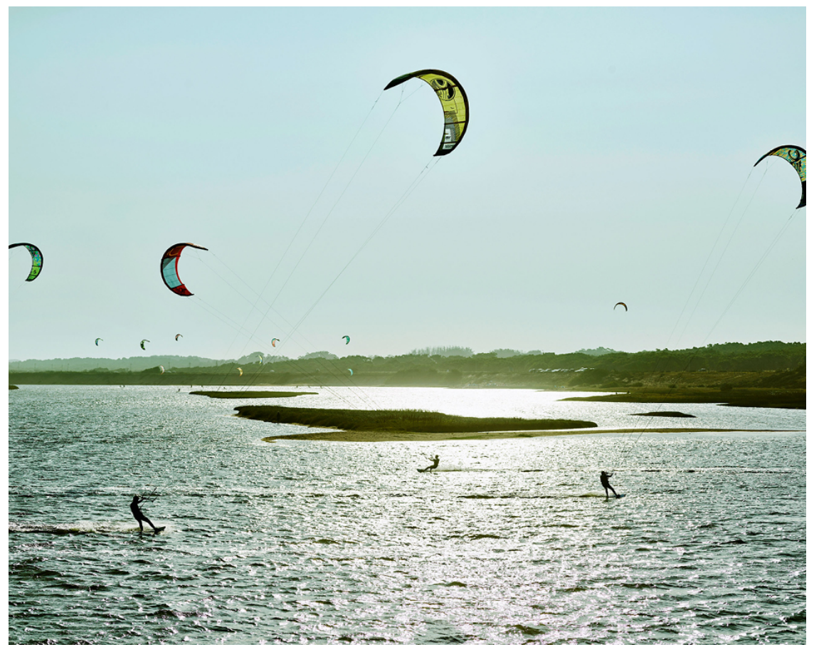
Kitesurfing on Laguna Garzón

When I was a 21-year-old college dropout, I worked on a ranch in Argentina for a couple of months as an honest-to-god cowboy, and I have fond memories of that time. It had been half a lifetime since I'd been on horseback, however, so when the Vik staff urged me to try a polo lesson, I resisted. First off, I reasoned, polo is for snobs. Second, I'd surely break my pelvis. Most disconcertingly, I'd undoubtedly make an ass of myself. I was proved wrong on all counts. The eternal thrill of man versus ball (in collaboration with a 600-kilogam beast) turned out to be intoxicating. I can't remember the last time I lost myself in something so thoroughly.