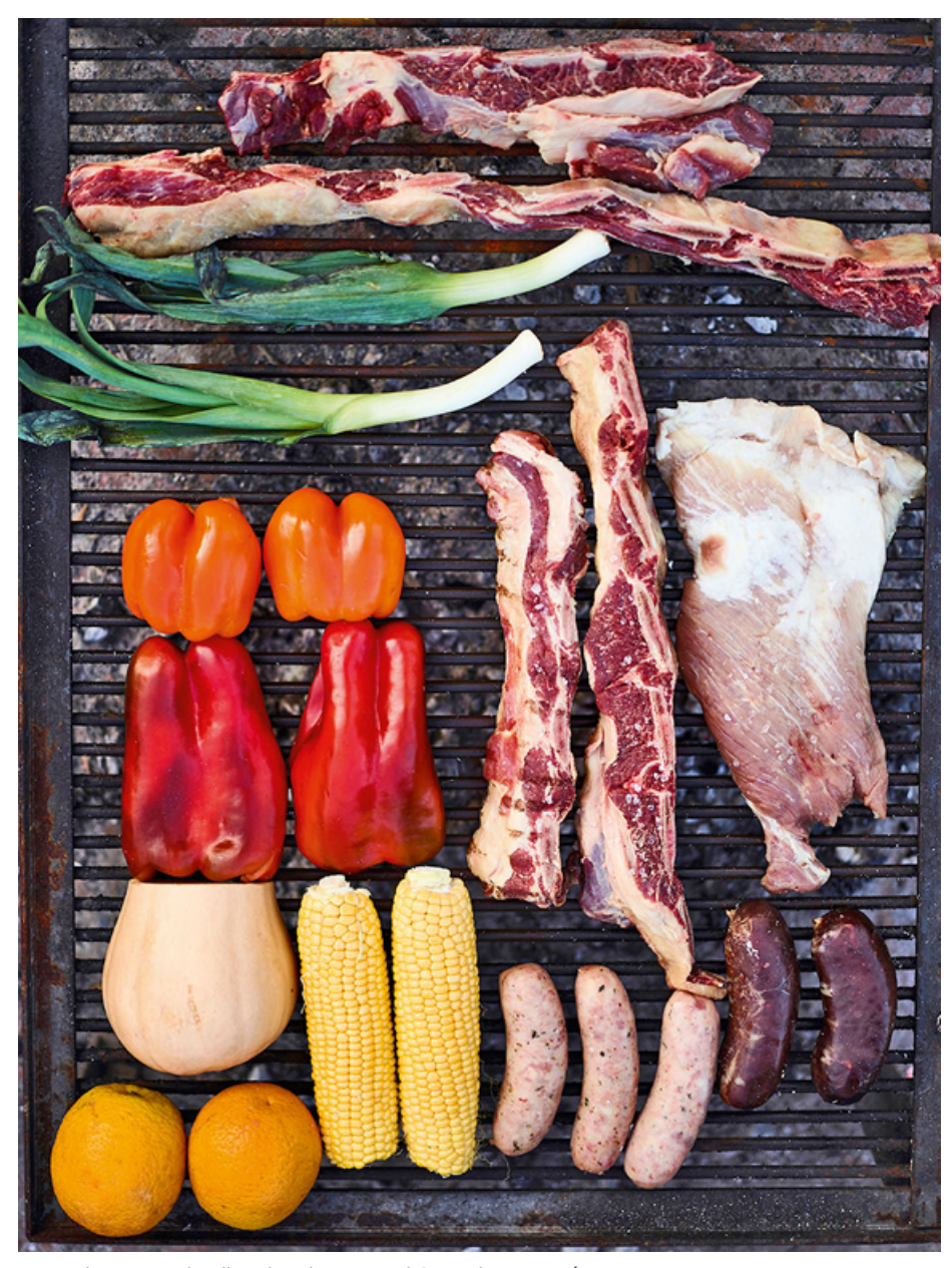
An asado, or mixed grill, at beach pop-up El Caracol, near José Ignacio.

My cousin was astonished when the polo-shirted maître d' seated us on the outside deck near the entrance. "This is the best," she cooed. "When they don't want people to see you, they put you in the back." We skipped past the sushi to order chipirones a la plancha (grilled squid), mollejas (grilled sweetbreads), and white corvina (cooked with almost nothing but salt, and one of the best, purest fish dishes I've ever had).