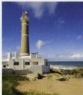
Right The lighthouse on Jose Ignacio beach

is as complicated as The Wolseley's. There's a sushi bar, international beers on tap and the world's smallest Lacoste boutique, tucked away near the wood-fired oven. The menu is simple: fresh fish, red meat, good salads, and pizza (prices are on a par with London). A not so family-friendly option is Namm, an isolated treehouse in the middle of the nearby forest, with hanging lanterns and Asian food – one of Mario Testino's favourite restaurants.