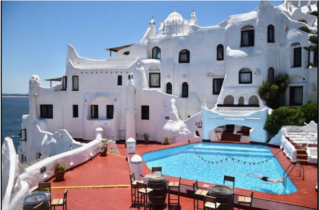
Casapueblo is a rambling hotel and museum constructed by Uruguayan artist Carlos Páez Vilaró in Punta Ballena.