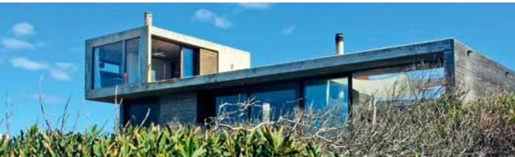
THE MODERN My Way property from boutique rental agency Oasis Punta

geographical reach and off-season appeal. The former trend has long been apparent, with outlying communities strung out northwards along the coast like José Ignacio and Garzón acquiring a cachet almost surreally at odds with their former lives (fishing hamlet and glorified railway station, respectively). The latter trend is being driven by major new tourist infrastructure, the kind which has investors unrelaxed about the idea of their assets being mothballed most of the year. Take the Fasano Las Piedras , which opened earlier this year and is the first venture