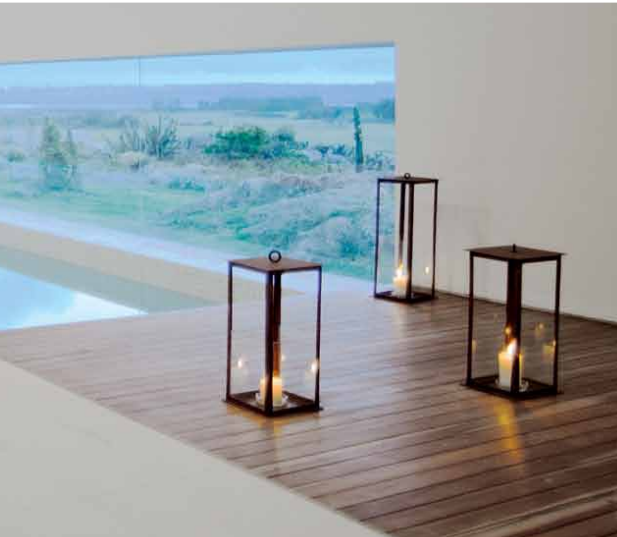
AN INDOOR POOL at Fasano Las Piedras