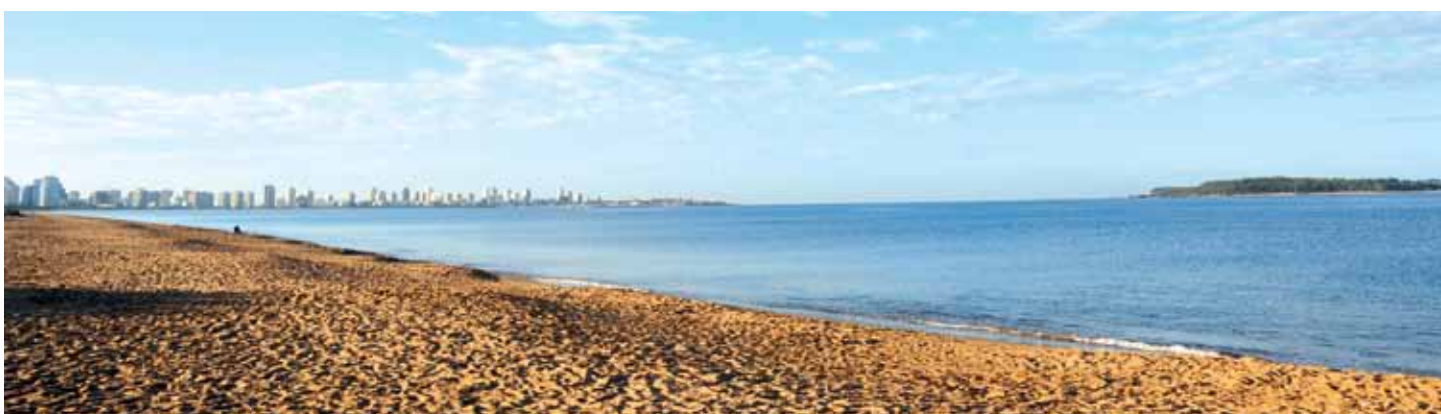
THE BEACH at Punta del Este, increasingly the off-season destination of choice for jet-setters and offbeat travellers alike

Further up the coast in modish José Ignacio, there's another new property aiming to be more than just a liminal zone between beach and party. Designed by Uruguayan architect Carlos Ott, Playa Vik features six small houses, or casitas , surrounding a central two-storey "sculpture" building made from curved glass and titanium panels. A cantilevered infinity pool protrudes over the beach like a giant's diving board, and as guests wander through the terrace and dining areas they will pass original artworks from the likes of James Turrell, Anselm Kiefer and ►